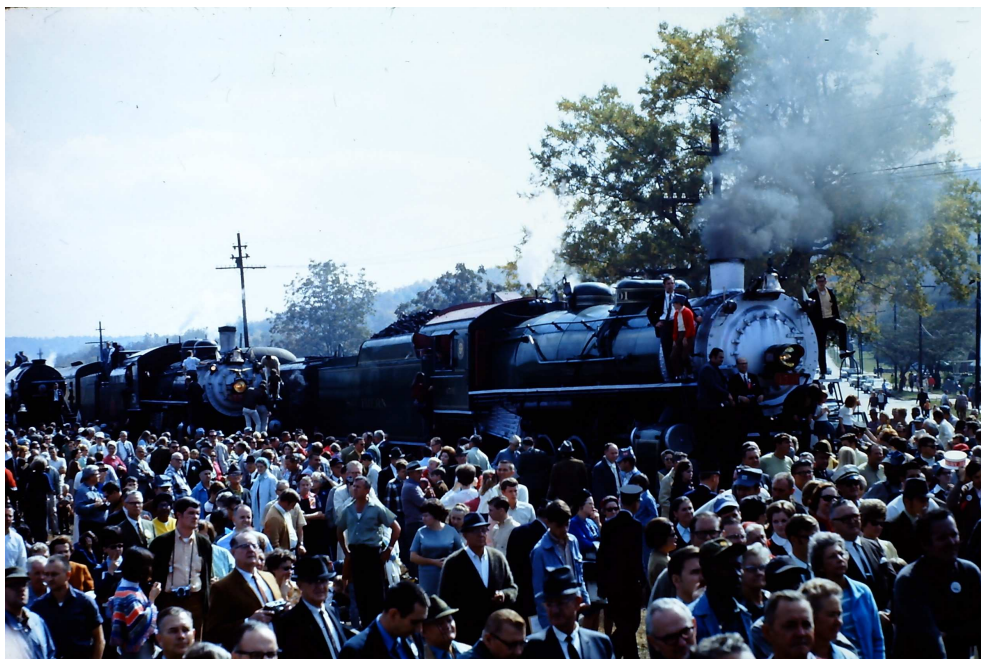
1969 appearance of Southern 4501, an MKT, and the Flying Scotsman.