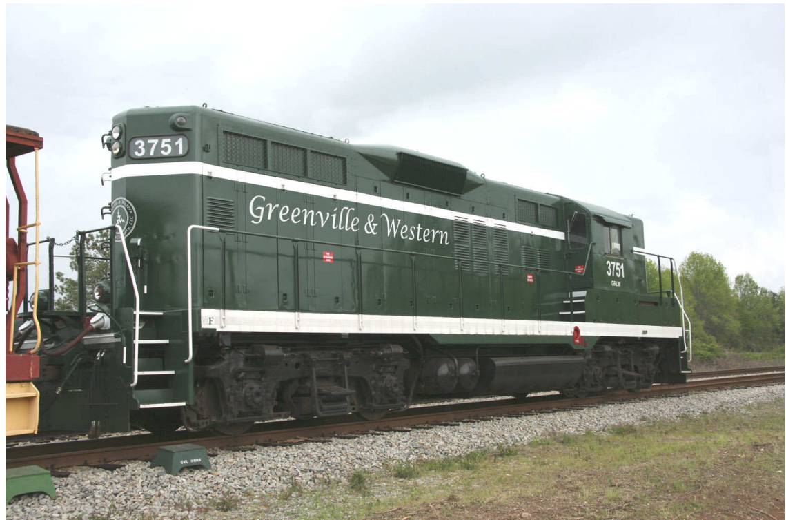
Belton, SC, April 19, 2008